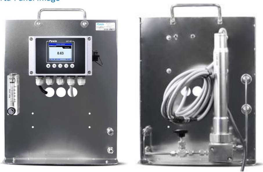
Figure 3. ST-774 Porta-Panel (P/N-42096)