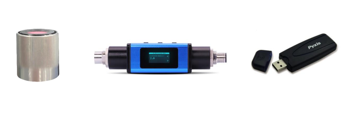
Figure 1 ST-774 Dissolved Oxygen Probe / DCC-2 Membrane Cap / MA-CR Bluetooth Adapter / MA-NEB USB Adapter