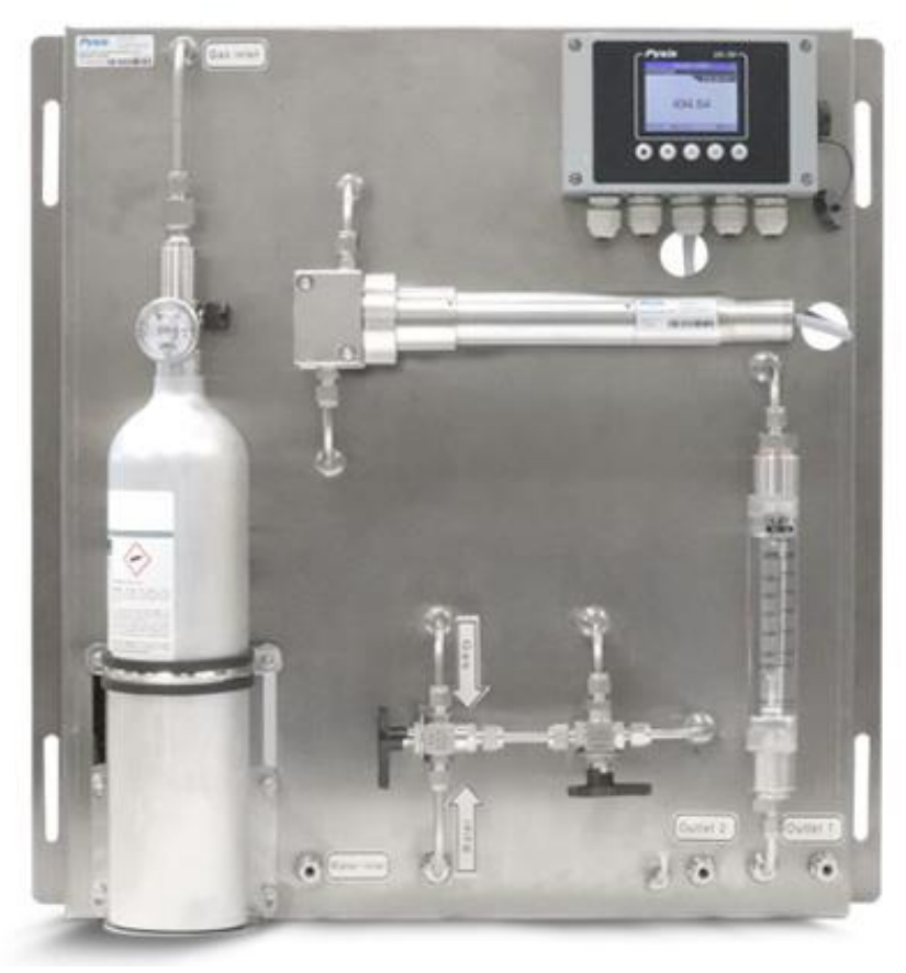
Figure 4. ST-774 PreMounted Flow+Calib Panel (P/N-42056) + Optional UC-50 Display (P/N-43007)