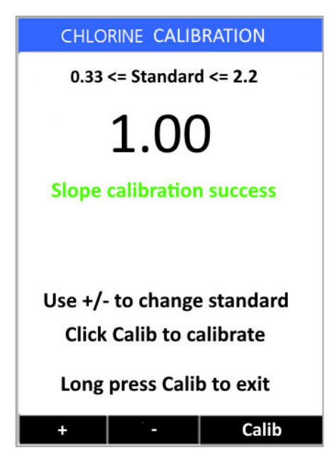
Figure 9. Slope calibration succeed

7. Click the CALIB button (labeled with OK) to start slope calibration, calibration results will be displayed as Figure 9.