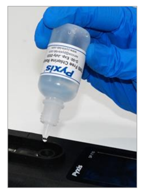
Figure 3. Add 3-Drops of TMB Reagent