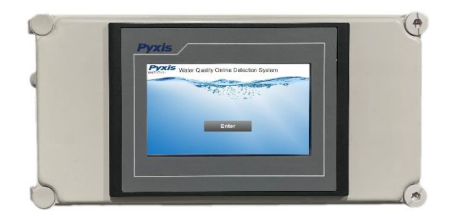
Figure 1 UC-100A Display + Data Logging Terminal

The Pyxis UC-100A is a microprocessor-based touch screen display and data logging terminal that can connect to up to 4 Pyxis sensors via RS-485. The UC-100A will be preconfigured by Pyxis Lab based on the Pyxis sensor utilized and enables rapid deployment and startup. The UC-100A provides live display and historical data trend charts for each sensor input as well as sensor calibration interface while logging data for of all inputs via USB download or transmission via Modbus RTU and/or Modbus TCP. The UC-100A may be installed as a stand-alone device or directly wired to any receiving controller, PLC or DCS network. Users may also purchase UC-100A with integrated Pyxis CloudLink 4G Gateway with or without a prepaid global SIM card, making the UC-100A a comprehensive data gateway to cloud data acquisition and service programs for live mobile visibility, data download and reporting. The UC-100A also comes equipped with two extra 4-20 mA inputs, outputs that can be used to log data from non-Pyxis analog device.